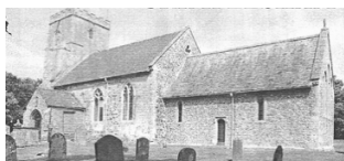
ST MARY'S, CRIMPLESHAM